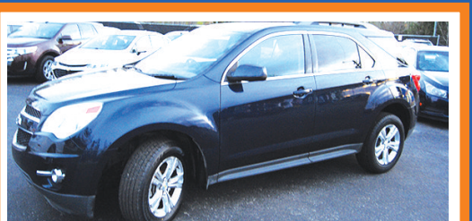
2015 CHEVY EQUINOX LT Rear camera, 115 K miles.