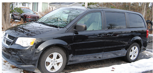
2013 DODGE GRAND CARAVAN SE 120,219 MILES ▶ 17 / 25 MPG