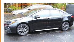
2020 Toyota Corolla XSE Leather, bluetooth, moon roof, 67 K miles. Sharp car! Cash Price $22,995 As low as $389 a month