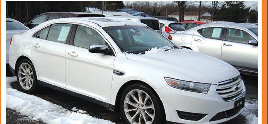
2013 FORD TAURUS Moon roof, rear camera, 114 K miles