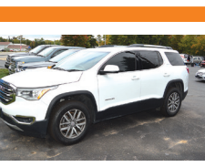
2019 GMC Acadia SLE 2 AWD As low as $466 a month Cash Price $24,995