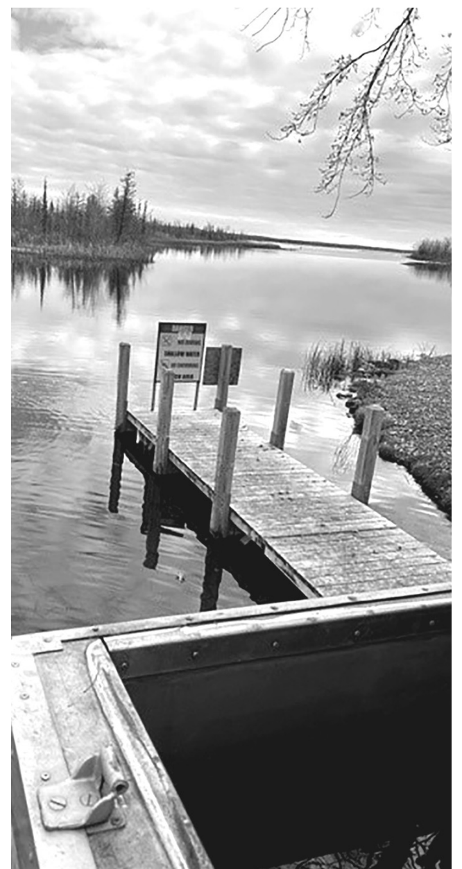
Thompson State Fish Hatchery staff enjoying the view after stocking fall fingerling musky in the Black River in Cheboygan County.

In general, fish are reared in Michigan's state fish hatcheries anywhere from one month to one and