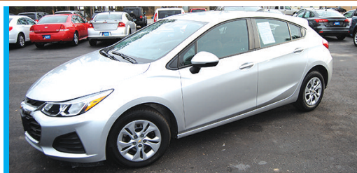
2019 CHEVY CRUZE 2019 Chevy Cruze. Low miles, great MPG