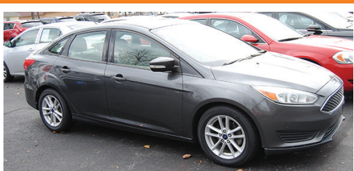
2017 FORD FOCUS SE Great MPG, 143 K miles.