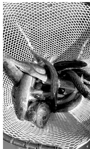
A net full of healthy fall walleye fingerlings, reared in a Michigan DNR pond in Roscommon County, are ready to be stocked as part of the DNR's fall walleye stocking efforts.

— Thompson State Fish Hatchery (Manistique) stocked three locations