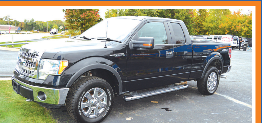
2013 FORD F-150 150,928 MILES ▶ 14 / 19 MPG