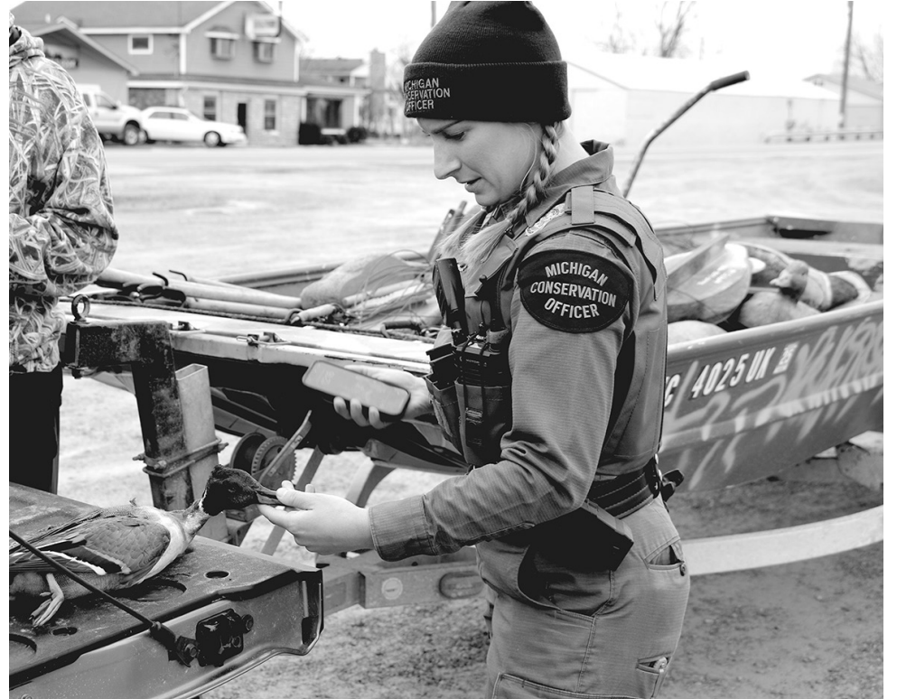
The work of DNR conservation officers and other staff is featured in the Outdoor Channel's "Wardens" TV show, starting a new season Jan. 26, 2024.

Since the show began featuring the Michigan