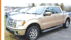
2012 Ford F-150 4x4, crew cab, bedliner, tow pkg. 153 K miles. Cash Price $19,995 As low as $339 a month