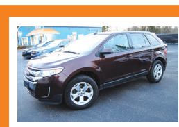
2012 Ford Edge SEL AWD rear camera, high miles. Cash Price $8,995 As low as $219 a month