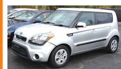
2012 Kia Soul Cash Price $6,995 As low as $199 a month.