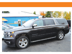
2015 Suburban LTZ 8 passenger, leather, 208K mi. Cash Price $19,995 As low as $339 a month