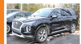
2021 Hyundai Palisade H-Trac AWD, leather, 3rd row seats 8, rear camera. 51 K miles. Cash price $31,995 As low as $469 a month