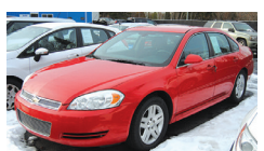
2012 Chevy Impala LT 167 K miles. Cash price $6,995 As low as $199 a month