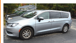
2021 Chrysler Voyager As low as $485 a month Cash Price $25,995